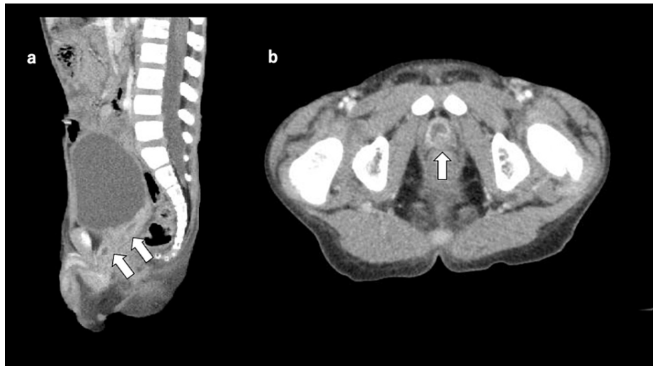
FIGURE 1: Contrast-enhanced computed tomography

A contrast-enhanced computed tomography scan revealed multiple prostatic abscesses with rim enhancing and fluid collection. (a) Sagittal view, (b) axial view.