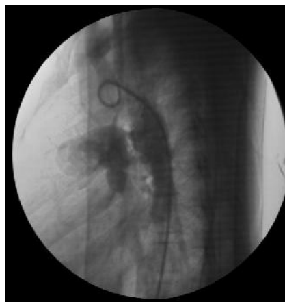
Fig. 1: Descending aortogram in lateral view showing medium sized patent ductus arteriosus

Subsequently, a 0.032 inch (0.8 mm) exchange wire was placed across the ductus from the pulmonary artery using a 4 or 5 French multipurpose catheter. Over the wire a 6 or 7 French long sheath (AGA Medical Corporation) was introduced from the right or left femoral vein through the ductus into the descending aorta. The ADO was chosen 1-2 mm larger than the narrowest part of the PDA. Under fluoroscopy guidance, the device was introduced into the delivery sheath and advanced into the descending aorta, where the retention disk was deployed. Then, the sheath and delivery cable were pulled back until extruded in descending Aorta against the aortic end of PDA, while a gentle tension was