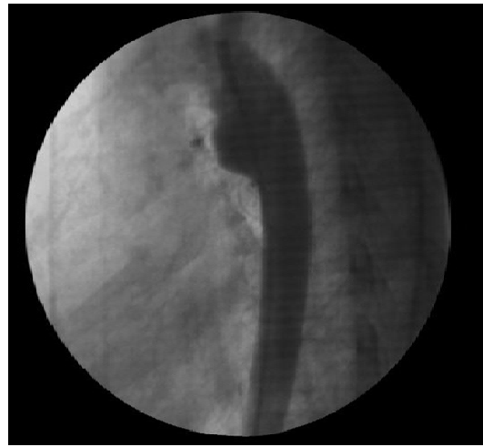
Fig. 3: Descending aortogram in lateral view after release of the amplatzer duct occlude showing complete occlusion and appropriate device position

maintained on delivery cable. The introducing sheath was withdrawn into the pulmonary artery to deploy the conical part of the ADO. With the device still attached to the cable, descending aortogram was performed to confirm proper device position and exclude aortic obstruction or significant residual shunt (Fig. 2).