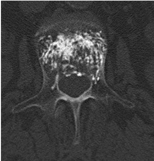
Fig. 3. Postoperative axial CT scan revealing the interdigitation of VK100 without destroying the trabecular structure.

functional scoring of the patients and the control groups are the main draw-backs of our study and preclude reaching a more definite judgment. Short follow up periods of the patients may be the reason for the low number of subsequent fractures as some impending fractures that may occur in the long term could be present. The heterogeneity of the patient group regarding the etiology and the number of the spinal levels treated may have led to misinterpretation of VAS scores. The demonstration of VAS changes over time would interpret the clinical outcome in a better view. The lack of the control groups and the retrospective design of the study are certain objections as some key statistics cannot be measured. As a result of the retrospective aspect, an accurate record-keeping of the clinical and the radiological outcomes was not present. Thus, randomized controlled trials with long-term follow-up periods are required for further evaluation of the elastoplasty technique. However, we believe that this is an important study as there are very few studies in the literature reporting on the results of elastoplasty technique using VK100 in the treatment of VCFs.