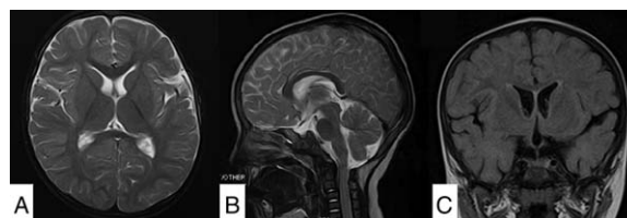
FIGURE 2. Magnetic resonance imaging on the fourth day of conservative management. Transverse (A), sagittal (B), and coronal (C) planes were performed which revealed acute subdural hematoma complete resolution without redistribution to upper cervical spinal cord.

From the *Department of Neurosurgery, West China Hospital, Sichuan University, Chengdu; †Department of Neurosurgery, First Affiliated Hospital of Kunming Medical University, Kunming; and ‡Department of Radiology, West China Hospital, Sichuan University, Chengdu, China.