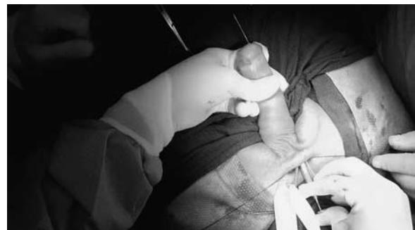
Figure 4. Cylinders placement.