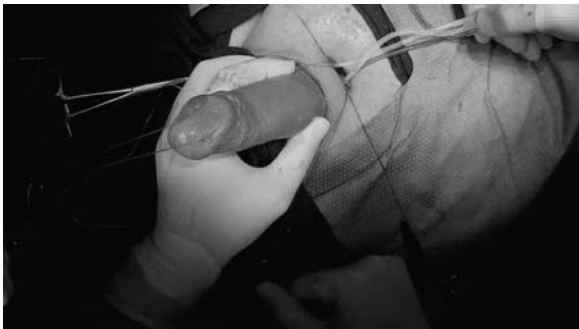
Figure 5. Hydraulic test.