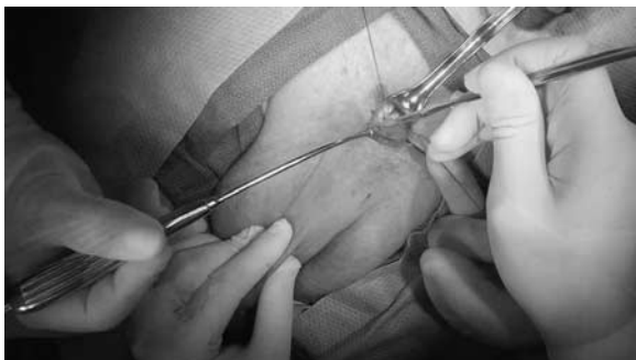
Figure 1. Skin incision and bilateral corporotomy.

The implants were performed by a minimally invasive technique and, after the patient was shaved, the skin prepped for 10 min with a povidone-iodine solution and intravenous cefazolin was administered. The first step is induction of an artificial erection that allows to identify any pathology needing correction, verifies 'true' dilation of the corpora supplanting serial dilations and facilitates the identification of the dorsal nerve and lateral placement of stay sutures. An infrapubic 3 cm skin incision followed by 1.5 cm bilateral corporotomy incision is applied (Figure 1). Using the Furlow, the proximal and distal corpora cavernosa are