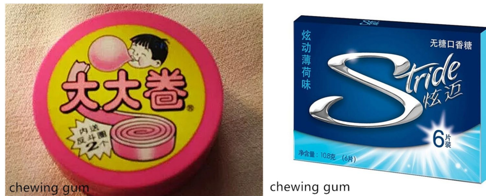
Figure 2. Examples of stimuli (i.e., chewing gum): nostalgia (left) and control (right). The left object depicts the popular chewing gum from childhood; the right object depicts the contemporary popular chewing gum.