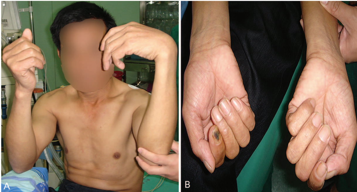
Figure 1. The symptoms of a 50-year-old man who suffered from injury of the radial nerve, median nerve, and ulnar nerve of his left upper limb due to the autogenous compression after drunkenness. (A) The fingers and wrist of the left hand were dropped, and presented as a “claw-shaped hand” deformity. (B) The left forearm flexor muscles group, major and minor thenar were apparently atrophied compared with the contralateral side.

deformity. The left forearm flexor muscles group, the major and minor thenar, was characterized as muscle atrophy (Fig. 1). The sensory function of the dorsal side of the left forearm, the major and minor thenar area and the tiger’s mouth area was decreased. Moreover, the motorial function of the left thumb against the palm was absent. In addition, the muscle strength of the left upper limb was apparently decreased, the left brachioradialis muscle strength was grade 0, the ulnar wrist flexor muscle strength was grade 3, the wrist and finger flexor muscle strength were grade 4, and the wrist and finger extensor muscle strength was grade 0. The clipping paper test of the left thumb and index finger was positive, while the Hoffmann test was negative.