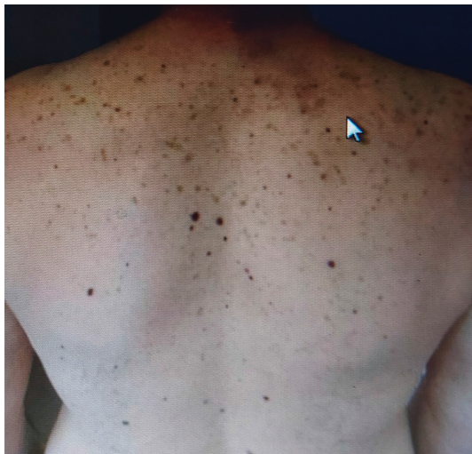
FIGURE 3: Resolved skin lesions of herpes zoster.

count of 98 cells/mm 3 , 9.5%. Males were more at risk of developing IRIS [11]. Also, the rate of HIV infection is higher in males compared to females [12]. The spectrum of infections now recognized as associated with IRIS is expanding and includes a number of parasitic infections, which may be mediated by different immunopathological mechanisms. Here, we included also visceral leishmaniasis [5]. Visceral leishmaniasis (VL) is a common opportunistic infection in HIV-positive patients from endemic countries but occurs rarely following antiretroviral treatment [13]. It is a vector-borne infection that is transmitted to humans through the bite of an infected sandfly which usually becomes infected from blood of infected animals in particular dogs. Clinical symptoms mostly include fever, weight loss, liver, and spleen enlargement which were found in our case as well. Albania is an endemic country for Leishmania [14]. In 2014, Badaro et al. noted that 34 cases of leishmaniasis as a manifestation of IRIS have been described worldwide [15]. The mean time between the onset of HAART and the occurrence of leishmaniasis IRIS-related manifestations was 6