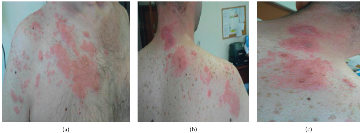
FIGURE 2: (a)–(c) Maculopapular lesions at different angles of herpes zoster. The three photos were taken on the same day. All stages of HZ can be seen: erythema, pustules, and crusts on the right thoracic region with dermatome C5, C6, C7, C8, and T1.