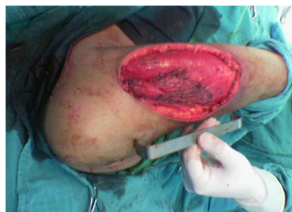
Figure 5 Tumor bed.

extragonadal GCTs from metastatic tumors in which the primary testicular lesion has regressed [15-17]. Extragonadal non-seminomatous GCT should be considered in the differential diagnosis of histologically poorly differentiated cancer and of neoplasms of unknown primary site, particularly in young men with midline disease. In our patient's case another uncommon differential diagnosis must be evoked: it is a soft tissue metastasis from primary testicular cancer [18].