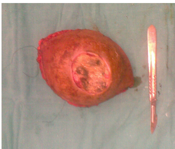
Figure 4 Macroscopic aspect.

majority of patients have clear evidence of germ cell features or teratoma, while a small subset have a poorly differentiated tumor without distinctive germ cell features. In our patient's case the diagnosis of teratocarcinoma was established on the basis of pathological examination, which showed the combination of teratoma and embryonal carcinoma [13]. However it is important to note that the term teratocarcinoma has largely been abandoned, and these tumors are referred to as a malignant mixed GCT, with a description of the specific germ cell elements present. Once the diagnosis of a germ cell tumor has been established, a primary testicular tumor must be excluded. Testicular palpation is insufficient to exclude a testicular primary; ultrasonography should be performed in all patients [14]. It may be difficult to distinguish true