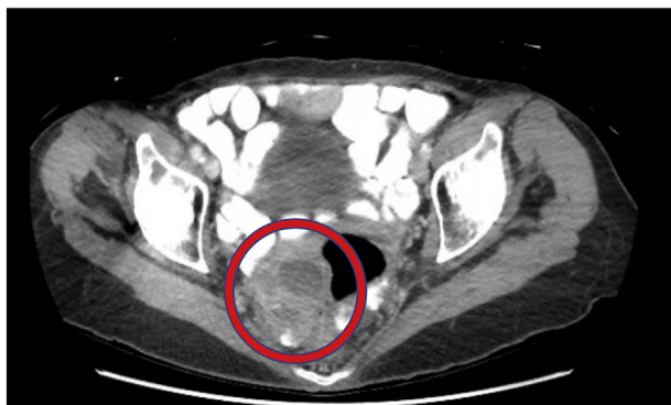
Fig. 1. CT scan May 2017, illustrating a right adnexal mass measuring 5.8 cm × 5.0 cm.