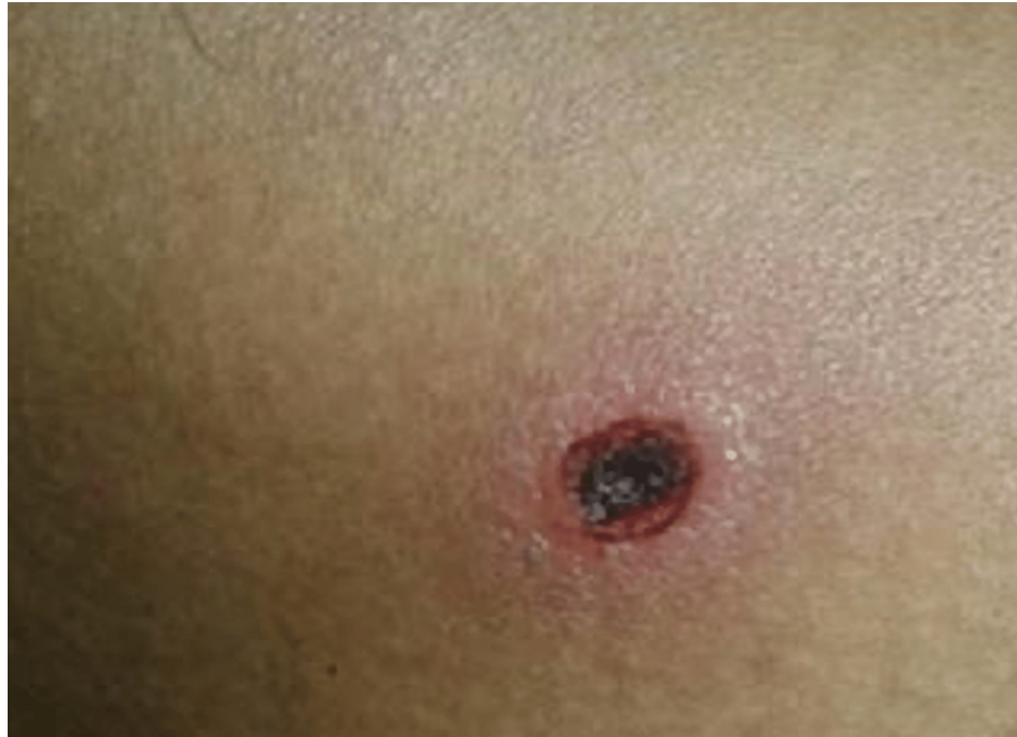
FIGURE 1: Blackish eschar on the back showing portal for Scrub typhus.

Investigations were done as shown in Table 1, and peripheral smear suggestive of haemoparasite -ring of plasmodium vivax, plasmodium falciparum as shown in Figure 2 with schizonts and gametocytes of plasmodium vivax as shown in Figure 3 impression of peripheral smear positive for malarial parasites with moderate thrombocytopenia with mild hypochromic anemia. Cerebrospinal fluid (CSF) analysis was normal.