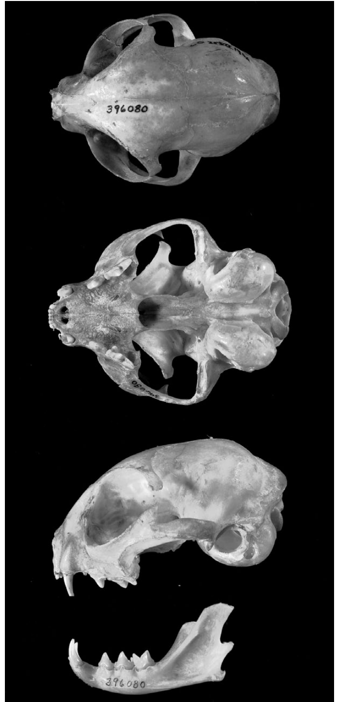
Fig. 2.—Dorsal, ventral, and lateral views of skull and a lateral view of mandible of Felis margarita thinobia . The specimen photographed was an adult male that was collected on 25 July 1966 by J. A. Anderson at Nushki, Pakistan, at an elevation of 1,068 m USMN (United States National Museum) 396080.

(10.5–11.5); zygomatic breadth 70.5 (66.0–74.0); postorbital breadth 33 (31–35); infraorbital breadth 25 (24–26); interorbital breadth 18.8 (17.9–19.5); and greatest length of skull 88.7 (86.0–90.5—Goodman and Helmy 1986). Mean (with range)