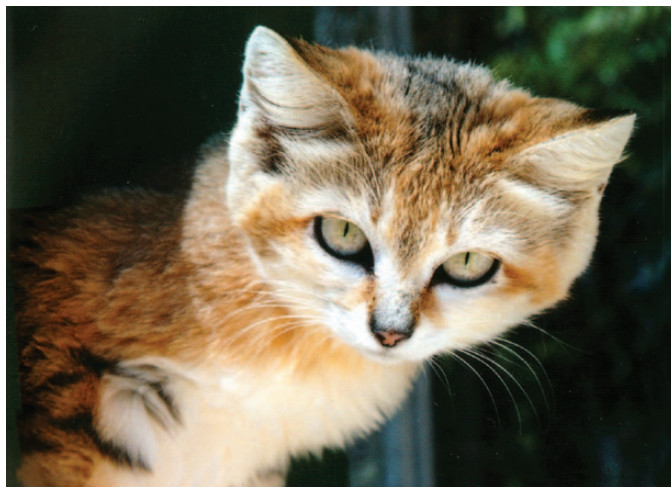
Fig. 1. —Adult Felis margarita .

Felis margarita margarita : Pocock, 1951:139. Name combination.