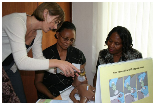
Pilot testing of Helping Babies Breathe 1st Edition in Dar es Salaam, Tanzania.

Lifesaving skills, such as bag-mask ventilation, often require more practice time, focus, and supervision than can be provided in a single-day workshop.