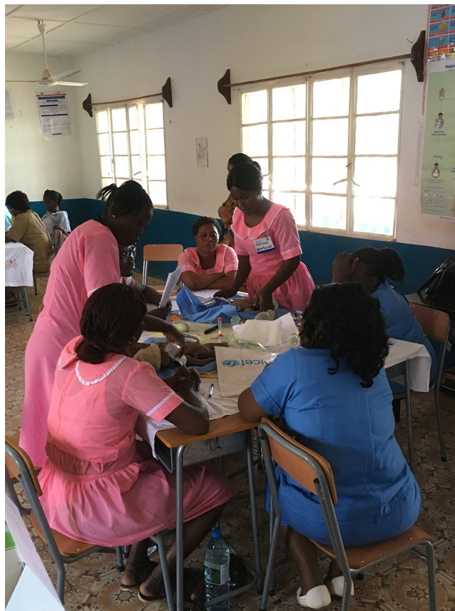
Field testing of Helping Babies Breathe 2nd Edition with MNCH aides in Kabala, Sierra Leone.

The global community must remain committed to introducing practices that will accelerate the reduction of overall neonatal mortality in order to meet the goals of the Every Newborn Action