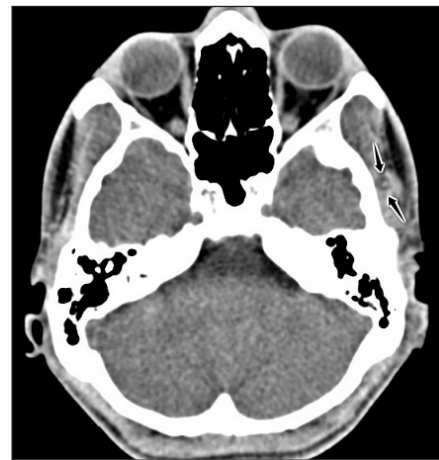
Figure 4: Axial CT in a 21-year-old patient at the level of temporalis muscle showing a cyst with mural nodule in the left temporalis muscle (arrow)