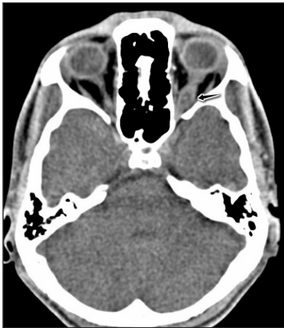
Figure 1: Axial CT section in a 21-year-old patient at the level of optic nerve showing a cyst with mural nodule in the mid portion of left optic nerve (arrow). CT: Computed tomography

Based on the above CT and MRI findings a possibility of cysticercosis was considered. The other possible differential diagnosis of optic nerve glioma, or optic nerve coloboma were also considered. However, the presence of scolex and another similar cystic lesion in temporalis muscle a diagnosis of cysticercosis was considered.