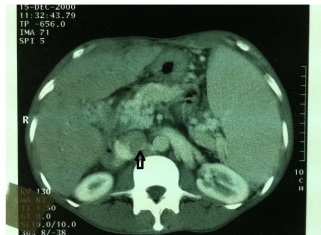
Figure 2 Contrast-enhanced computed tomography scan showing enlarged inferior vena cava with intraluminal clot (indicated by arrow), splenomegaly, and abnormally low enhancement of the liver.

On clinical examination, the patient looked frail and showed obvious signs of weight loss. His blood pressure was 120/80 mmHg. The most remarkable finding was a non-distended but diffusely tender abdomen. A complete blood count revealed leukocytosis at 12,300/ \mu L, predominantly with neutrophils; a hemoglobin level of 12 g/dL; and a normal platelet count. The patient's prothrombin time (PT) was 62%, with a prolonged kaolin-cephalin clotting time (KCT) of 41.5 seconds (control, 36 seconds); his blood sugar, blood urea nitrogen, and creatinine levels were all within normal limits. An abdominal computed tomography scan showed moderate dilatation of the inferior vena cava (IVC) with an intraluminal hypodensity consistent with venous thrombosis. The liver appeared hypodense compared with the spleen (Figure 2), with dilated intrahepatic veins that did not appear opacified, even in enhanced images (Figure 3), and there was homogenous splenomegaly. These findings were compatible with Budd-Chiari syndrome (BCS) secondary to IVC thrombosis. The patient was placed on a 10-day course of low-molecular-weight heparin, this in spite of the prolonged PT and KCT. Further anticoagulation was deemed risky because of the patient's irregularity in respect to follow-up appointments. He was therefore placed on low-dose aspirin and, as there was no local experience with transjugular intrahepatic portosystemic shunting, he was referred to a vascular surgeon in a hospital in Yaoundé, about 150 miles