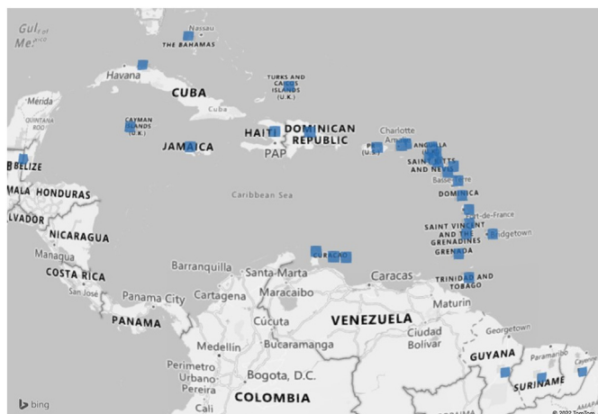
Fig. 1. Countries in the Caribbean community.

The only regional tertiary medical faculty in the Caribbean is the University of the West Indies. This institution has various campuses on different islands and serves as a hub for many locals across the region (University of The West Indies, 2022; Browne and Shen, 2017). There are currently active neurosurgical graduate training programs affiliated with the university in two islands, Jamaica and Trinidad and Tobago. The graduate training program in Trinidad and Tobago has been recently established over the last 5 years, with its first graduating students occurring within the near future. On the other hand, Jamaica has a long recognized training program over decades, producing several neurosurgeons in the region (Fletcher et al., 2003). Contrastingly, where these two islands may have one neurosurgery training program, Cuba has multiple active training programs. A direct source of neurosurgeons to maintain the neurosurgical workforce on that island.