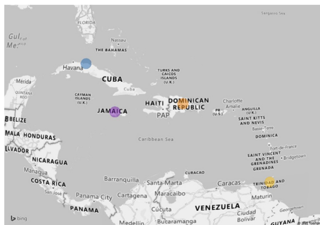
Fig. 4. Countries with local neurosurgical training programs.