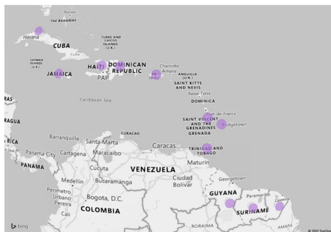
Fig. 3. Countries with regional medical schools.