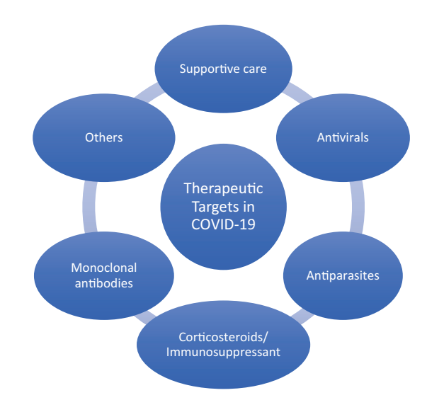
Figure 3. COVID-19 therapeutic approaches. Data source.<sup>89-128</sup> Note: General overview.

It is pivotal to promote the development of effective vaccines for the prevention and control of the virulence and spread of COVID-19 given the rapid transmissibility and spontaneous emergence of the SARS-CoV-2 variants, the severity of the COVID-19 symptoms, and the increased morbidity and mortality rates. It is crucial to explore various therapeutic agents that can block or inhibit the replication and dissemination of the virus or inhibit the inflammatory responses of the antibodies to reduce the cytotoxic effect and immunological pathologies of the virus. Moreover, diagnosis and control of COVID-19 have been quite difficult. Asymptomatic carriers of SARS-CoV-2 who do not show any clinical symptoms can transmit COVID-19 to healthy individuals directly or indirectly by physical contact through coughing or sneezing. Also, it is difficult to control the transmission of the disease from the patients who recovered from COVID-19 to healthy individuals. Discovering new therapeutics for the treatment of COVID-19 is a huge challenge because of the viral genetic recombination of the highly mutable single-stranded RNA CoV genome.<sup>89,90</sup> At the inception of the COVID-19 outbreak in China, several therapeutic agents were used to treat patients but were found to be