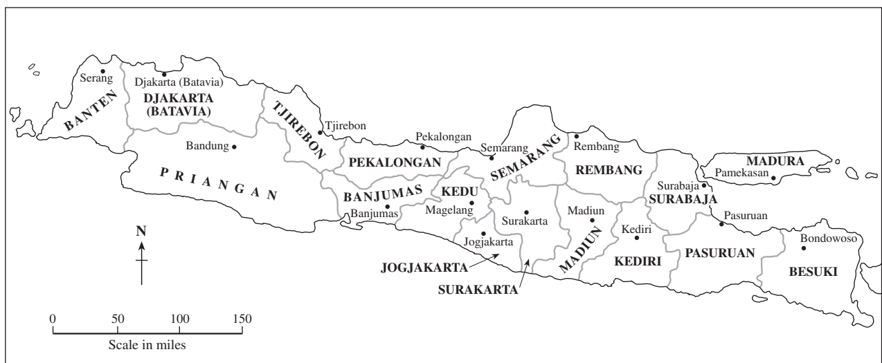
Figure 1 Map of the residencies of Java in 1920