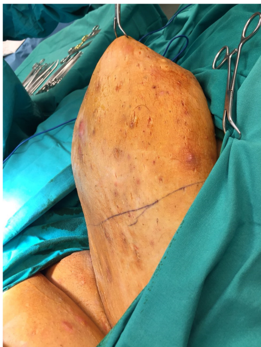
Fig. 1. Tc-99m-MIBI scintigraphy detected an ectopic adenoma located in the lower anterior mediastinum, on the left of the median line.