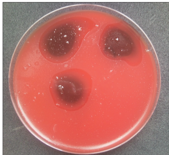
Figure 2. The inhibition of growth of Enterococcus faecalis colonies on the Müller-Hinton agar in the area of Gelclair application (the clear zone).

and there is no available information about Gelclair’s impact on oral cavity microbial colonization. Based on the fact mentioned above, we decided to conduct this study.