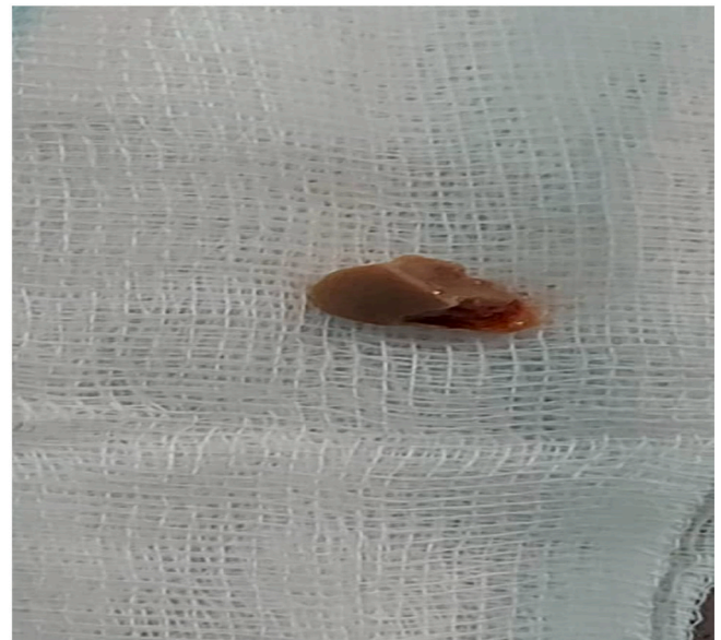
Photograph 2. A piece of chicken bone upon its removal by means of bronchoscopy.

FB inhalation tends to be manifested invariably where children presents with cough where at the scene cough is of sudden onset, choking, and wheezing and may lead to acute respiratory failure and sometimes death [3,20].