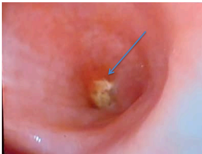
Photograph 3. Intraoperative endoscopic view of the foreign body in the right intermediate bronchus.

Imaging techniques are of importance in establishing the diagnosis of FB inhalation especially when it's radiopaque or by showing mere indirect signs of its presence in the tracheobronchial tree and such signs include lung collapse, lung hyperinflation and cystic bronchiectasis though it may be a usual finding to find a normal radiologic evaluation or a non-specific evaluation being not consistent with FB aspiration [1,3,9,14,16]. Such non-consistent findings may be depicted from the study that was conducted in China where radiologic report was found to