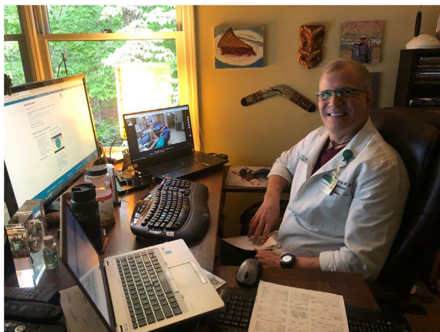
FIGURE 1 Remote physician supervising resident physicians from home. The near laptop is displaying the electronic medical record, the distant laptop provides the camera and audio view of the emergency department (ED)

attending physician coverage. Each attending physician covers one of 3 resident pods, each made up of 9–11 patient rooms. This level of physician staffing permits the replacement of 1 physically present attending with a remote attending in one of the pods. The remote physician-staffed pod is also covered by a senior EM resident and is in a central location, which allows the physically present attending to be immediately available for any critically ill patients or to assist with the performance of a necessary procedure.