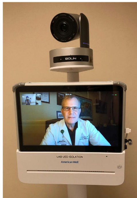
FIGURE 2 Patient experience with telemedicine

We have also used telemedicine carts in our triage area to perform no-touch physician evaluations in isolation rooms and to provide access for patient evaluations by specialists in the ED.