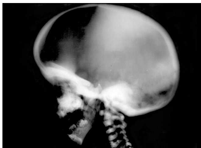
Fig. 1: Skull vault showed dense bone with narrowing of skull base and elongated head