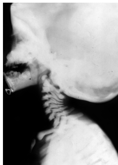
Fig. 2: Cervical spine lateral view showed generalized increase in bone density (Chalky white) and skull is looking big

Patient medical reports revealed that, boy was alright at first year of age, bleeding from the nose on and off since last 1 year. There was 5 to 10 cc of loss of blood every time. Repeated chest infections, diminision of vision since 3 years, fever, cough, patient was having hurried breathing each time and subsides after treatment and low set ears but no history of loss of hearing. Depressed nasal bridge, micrognathia, short fingers, flat feet, pigeon chest deformity,