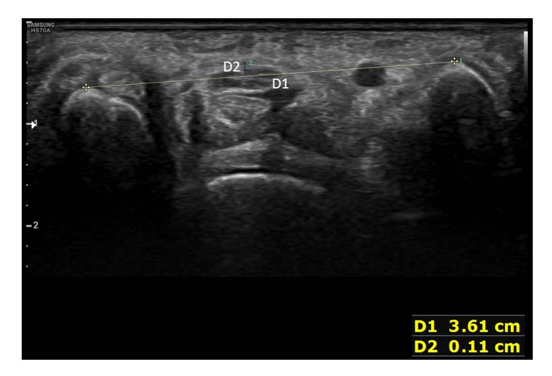
Figure 2. Diagnostic criteria for carpal tunnel syndrome by ultrasound relevant to palmar bowing of the flexor retinaculum. The yellow dot line of D1 shows a line connecting the top of the pisiform and the scaphoid bone. D2 is the distance from D1 to the transverse carpal ligament.

Figure 1. ( A ) Scanning the anterior aspect of the wrist. The ultrasound indicator is in the radial side. ( B ) Structures that can be observed with ultrasound in the proximal carpal tunnel: Transverse carpal ligament (arrow); Sca, scaphoid; Pis, pisiform; MN, median nerve; UN, ulnar nerve; UA, ulnar artery; Fcr, flexor carpi radialis; Fpl, flexor pollicis longus; Fcu, flexor carpi ulnaris. Tendons of the flexor digitorum superficialis and flexor digitorum profundus are located deep within the carpal tunnel.