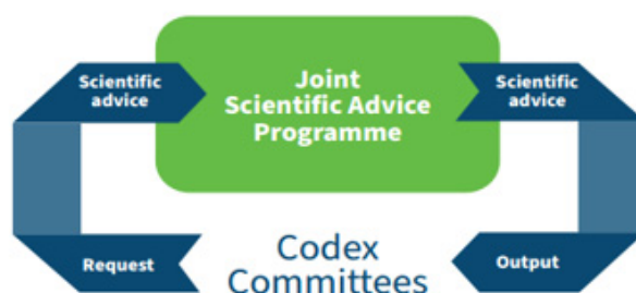
Figure 1. Information flow between JEMRA and the Codex Committee on Food Hygiene (CCFH).

The primary purpose of the establishment of JEMRA was to provide scientific advice to Codex. Based on their needs for information, Codex committees, primarily the CCFH, prepare specific request for information and communicate their needs for scientific advice to the JEMRA secretariat. As with other FAO/WHO Joint scientific Advice Programmes, the JEMRA secretariat works in close collaboration with Codex Committees' group Chairs to ensure that the scientific advice of JEMRA is truly tailored to the Committee's needs (Figure 1). Once complete, JEMRA reports back the Committees that have requested the information.