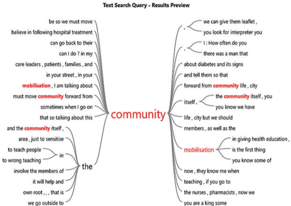
Figure 1. ‘Community mobilisation’ as used in context (NVivo extract).

Each interview was audiotaped, lasted between 45 and 60 minutes and was transcribed verbatim. Throughout the data collection phase, constant comparison ensured the collection of robust data from the nurses through an iterative process. During this process, emerging