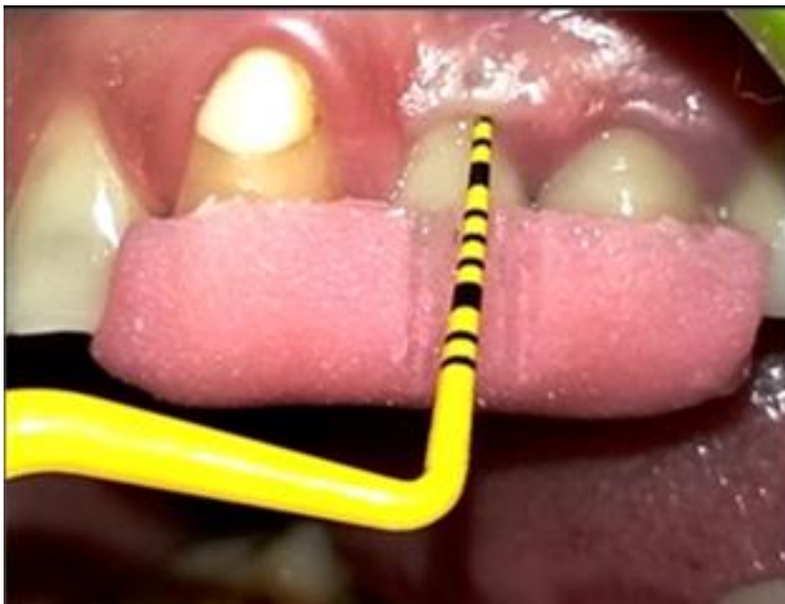
Figure 1: measurement of peri-implant probing depth