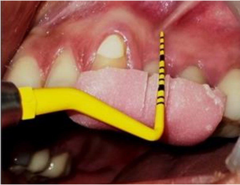
Figure 2: measurement of width of keratinized mucosa