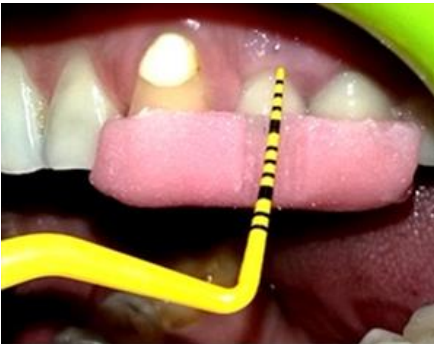
Figure 3: measurement of gingival margin level