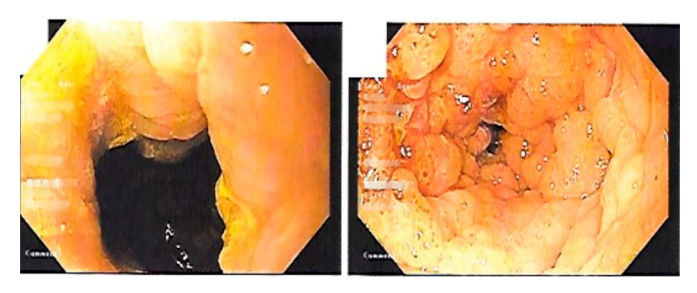
Figure 3. Sigmoidoscopy demonstrating edematous, fibrotic rectal mucosa.

retroperitoneal regions. She was evaluated by medical oncology and is currently receiving FOLFOX (leucovorin, 5-fluorouracil, and oxaliplatin) as a palliative chemotherapy regimen.