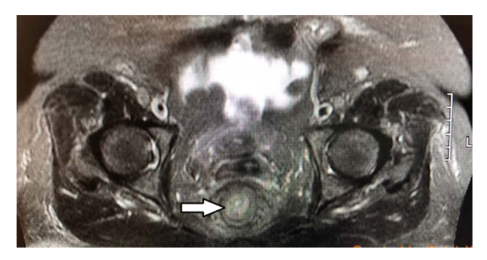
Figure 2. Pelvic magnetic resonance imaging showing diffuse thickening of the rectosigmoid colonic wall concerning for malignancy.

The patient had rapid progression of her disease process, and repeat imaging 6 to 8 weeks later demonstrated extensive lymphadenopathy in the cervical, mediastinal, axillary, and