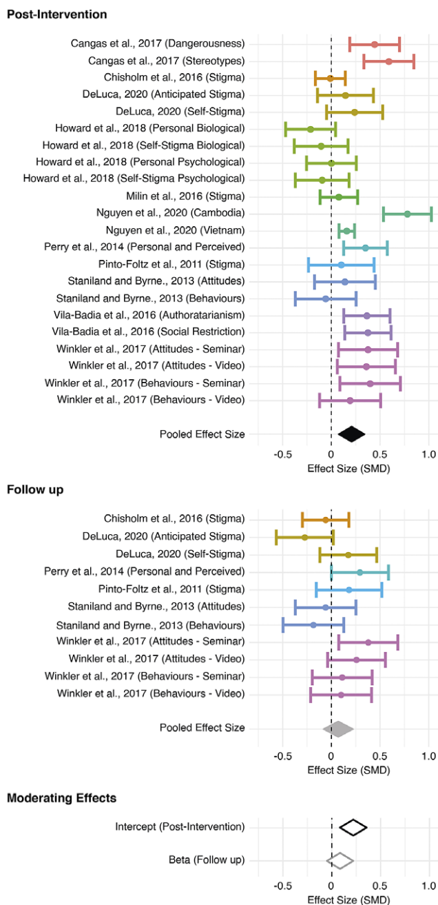
Figure 2. Effectiveness of anti-stigma interventions.

However, it is worth noting that six education-based interventions showed mixed effects and two were ineffective. This could be