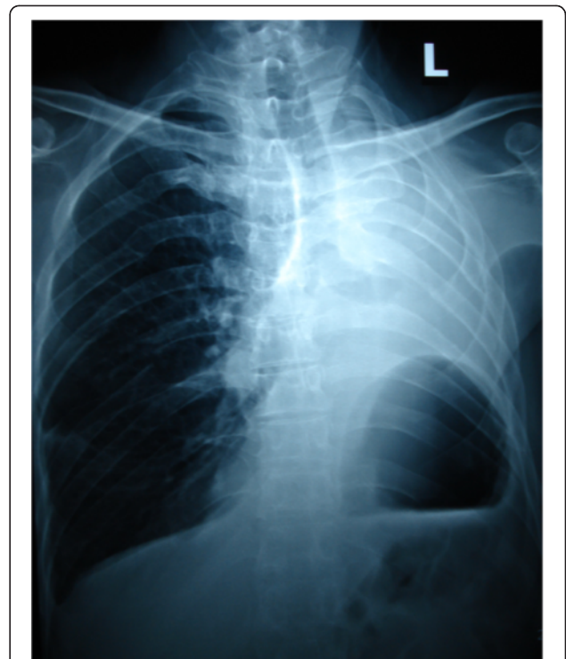
Figure 2 Standard radiograph done 25 days after surgery showing good expansion of the right upper and middle lobes and minimal postoperative inflammatory changes.

Since pulmonary resection offers the best opportunity for long-term disease free survival in lung cancer patients, it is accepted that these patients should be offered a second operation should they develop a second primary after previous lobectomy. Such a decision is, however, more controversial, in patients with previous pneumonectomy expected to require lobectomy for complete resection of that second primary. Most previously reported cases are in the form of case reports (2, 3, 5, 8, 9) and in the four largest series ever published (1, 4, 6, 7), only two out of a total of 65 patients underwent a lobectomy while the remaining 63 had wedges or segmentectomies. This reluctance to do a lobectomy after previous pneumonectomy in the context of lung cancer is because patients are at high risk of operative mortality due to respiratory