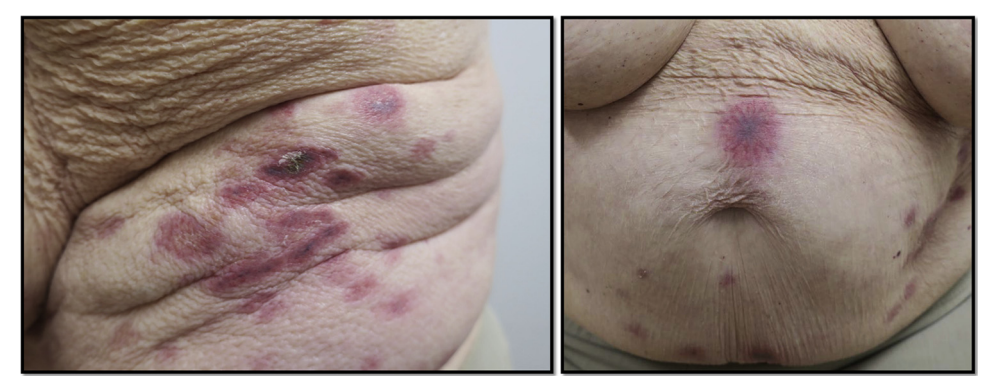
Fig 1. Progressive, partly infiltrated, asymptomatic plaques with purpuric center and telangiectasia, mainly located on the trunk.