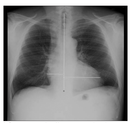
Figure 1: Postero-anterior chest X-ray projection where the measure of the transverse diameter of heart shadow (TDH) is reported. The measure was taken by drawing a line near the middle of the heart shadow and the spine and a line from the right border to that line. Another line from the left heart border, drawn to the middle, was added. The two lengths were added together to derive the TDH.

minimum of 30 cine frames for each slice. To measure LV volumes, the endocardial borders were manually drawn in all the short axis end-diastolic and end-systolic images, excluding papillary muscles. End-diastolic and end-systolic LV volumes were calculated and LVEF was derived.<sup>[19]</sup>