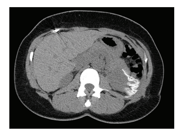
FIGURE 2: Postoperative CT abdomen demonstrating PTFE bolster on left kidney.

Communication was central to the success of this operative course. Preoperative evaluation by cardiology team and real-time consultations between urologist and anesthesiologist is critical to the success. The infrequent nature of concurrent malignancy in a heart transplant candidate with an LVAD means that there will never be a "process" of care pathway for these patients. Inclusion of this cardiac anesthesiologist was invaluable in terms of their experience with these patients. An arterial line was placed to monitor the pressure as noninvasive blood pressure monitoring is not