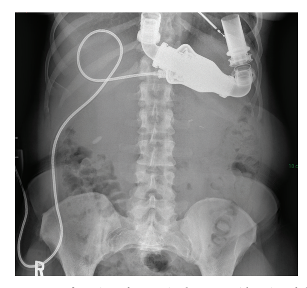
FIGURE 3: Confirmation of no retained sponge with series of abdominal plain films.

reliable in patients with continuous flow LVAD. The blood bank was prepared for the case and the appropriate blood products were available for transfusion. Cardiothoracic surgery was aware and in the operative suite in the event of any complication with the device or questions regarding the surgical anatomy. Postoperative care was performed by the cardiac intensive care unit with the urology team as consultants. It is the practice at our institution for patients with LVAD to be admitted to the cardiology service because of the complexity of these patients.