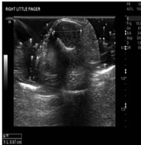
Figure 1: Little finger MSK ultrasound—19 July 2018 '16 × 8 × 7 mm' soft tissue lesion involving the nail bed and wrapping around the terminal phalanx of the right little finger suspicious for a GT.