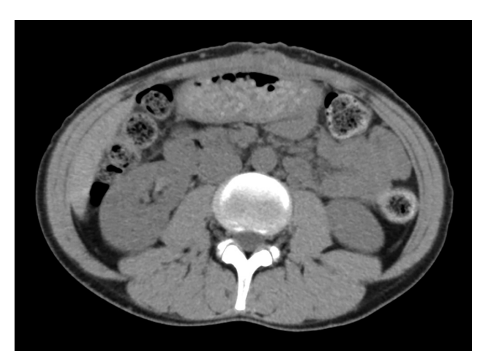
Figure 3. Computed tomography images obtained three months postoperatively. Axial view shows no recurrence and no seroma.

invasive surgery. However, a standard surgical procedure for DRA has not been established. Laparoscopic hernia repair decreases risk of infection, but earlier studies reported an increased risk of recurrence and bowel injury for large, complicated ventral hernia compared with open surgery. More recent reports have shown outcomes of laparoscopic hernia repair that are comparable to those for open surgery; however, some cases convert to open surgery. To date, the implementation of laparoscopic hernia repair has been restricted by technical and topological difficulties, especially for intracorporeal repair.