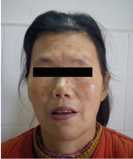
FIGURE 1: The eyebrows fall off.

hemorrhage. Unfortunately, owing to the limited medical resources in her hometown, she was not diagnosed as Sheehan's syndrome and did not receive enough professional treatment. Her menstrual periods prolonged (about 40–50 days) with little volume and short duration. In 1990, she conceived naturally for the fourth time but the symptoms got worse after delivery, especially in recent years. From 2000, she had unconsciousness for three times. She gradually had serious hypoglycemia, progressive fatigue, loss of cutaneous pigment, dryness, and furfuration of the skin, loss of muscle strength, and a decrease in libido after the fourth delivery. Nevertheless, she had no symptoms of vomiting, nausea, abdominal pain, or orthostatic dizziness. The family history of similar symptoms and previous history of hypertension or diabetes were not found.