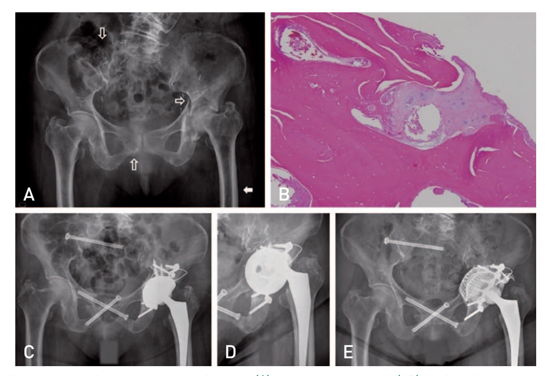
Fig. 1. Radiographic and histological images of case 1. (A) Initial anteroposterior (AP) pelvis radiograph, showing axial migration of the left femoral head into a protruding acetabulum with disruption of the medial wall. Concomitant fractures were found at ala of right sacrum and right pubis (arrows). (B) Histological findings of fractured fragmented bone from the patents of case 1, showing dead bone with empty lacunas and without any lining osteoblasts (H&E stain, ×100). (C) Postoperative AP pelvis radiograph, showing internal fixation with cannulated screw at ala of right sacrum and pubis. Left acetabular fracture was managed by internal fixation using a reconstructive plate on the posterior wall and wiring following total hip arthroplasty with primary cementless cup. (D) AP pelvis radiograph at 1 year after operation, revealing loosening failure of cementless acetabular cup. (E) Left acetabulum was reconstructed by impaction morselised bone graft on the wire mesh support.

A 77-year-old female visited the clinic due to aggravating bilateral hip pain for several days without any history of recent trauma. Her history included hysterectomy for cervical cancer approximately 17 years ago and she had no radiation therapy for the cancer. She had started taking 70 mg of oral alendronate once per week 6 years ago due to a diagnosis of osteoporosis. Fractures of the right ramus of the pubis, the right wing of sacrum, the left medial acetabular wall and the left femoral head were diagnosed via hip X-rays (Fig. 1A). The lateral cortex of the lateral femur was observed to be thickened in comparing with right side, but it was not significant and authors could not have confidence that the finding was correlated with the significant change from the alendronate use (Fig. 1A). The BMD measured in the 2nd lumbar vertebra region was 0.821 g/cm<sup>2</sup>. The T-score was –1.0. The BMD measured