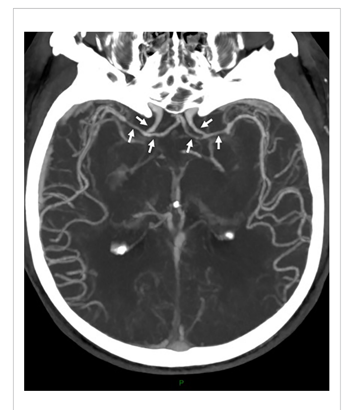
FIGURE 2 | CT-Scan angiography shows discreet and bilateral stenoses of the intracranial internal carotid arteries and of the anterior cerebral arteries (A1 and M1 segments) (arrows).

dexamethasone (10 mg x4/day) was initiated and pursued with three pulsed intravenous methylprednisolone (1 g) relayed by oral corticosteroid therapy (1 mg/kg). On day 10, the third CSF showed 1130 leukocytes/mm³ (82% of polymorphonuclear cells). Conventional microbiological explorations (as previously cited) were again negative. Despite the absence of known immunosuppression, Nocardia specific culture was conducted (culture media BCYE was seeded and incubated at 37°C in aerobic atmosphere during two weeks) and remained negative. From day 11, in the absence of any microbiological documentation, only anti-tuberculosis treatment and oral corticosteroids were continued whereas other empirical antibiotics were stopped. Neurological condition improved and the patient was transferred to the Internal Medicine department with persistent cognitive impairment.