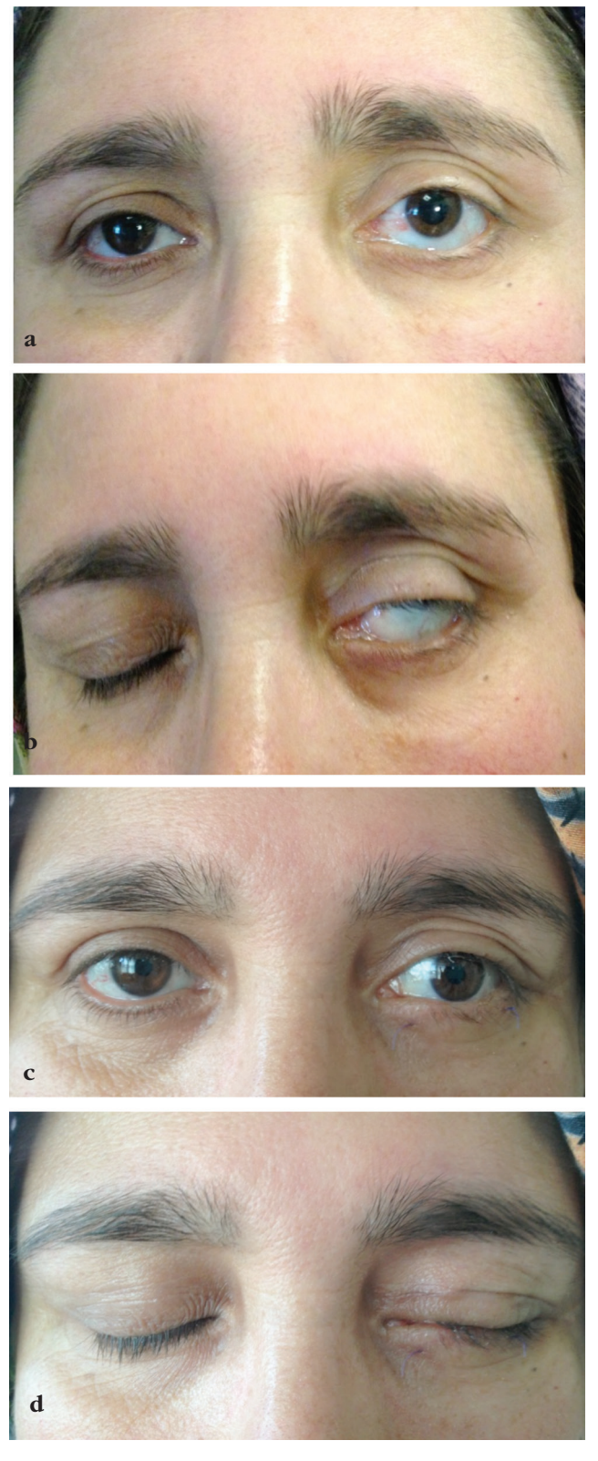
Figure 3. a, b) Mild upper lid retraction, pronounced lower lid retraction, and lagophthalmos due to left facial palsy. c, d) Lagophthalmos was alleviated and the lower lid rested at the limbus after gold weight implantation, suborbicularis oculi fat elevation, hard palate graft, and lateral tarsal strip procedures