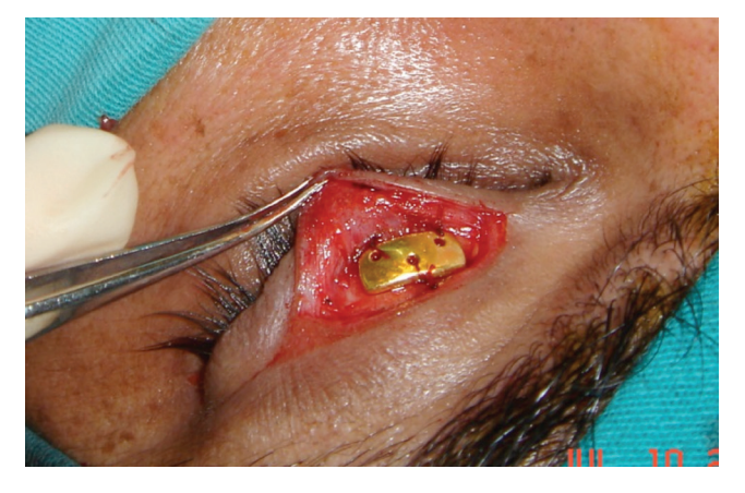
Figure 1. The gold weight implant was secured to the tarsal surface with 3 sutures

According to the criteria for lower lid success, of the 16 eyes of 15 patients who underwent SOOF elevation (LTS and/or hard palate graft), surgical success was achieved in 75% (6 successful, 6 partially successful) (Figures 2 and 3), while the other 25% (n=4) were not considered successful due to more than 1 mm of retraction.