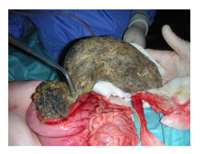
Fig. 1 Rapunzel syndrome (patient #1)