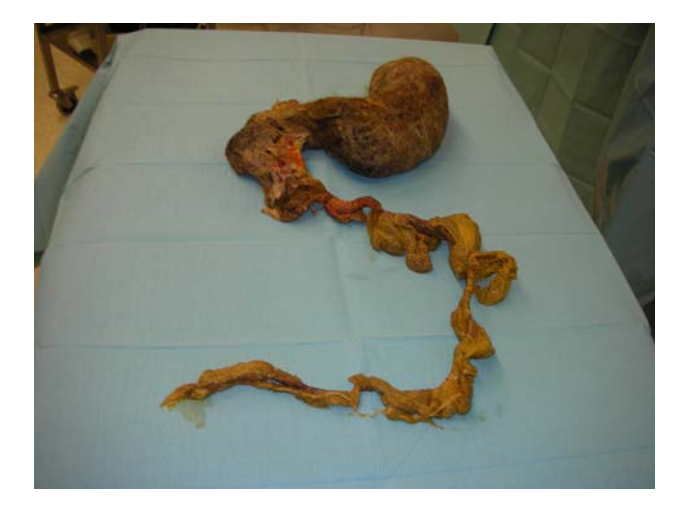
Fig. 2 Rapunzel syndrome: after removal: the cast of the stomach with the tail located in the jejunum (patient #1)

often not recognized at the initial presentation and the diagnosis is often delayed. Masses in the epigastric region are usually interpreted as suspected for malignant