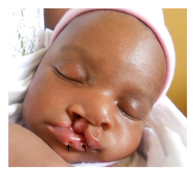
Figure 1. A patient with Van der Woude Syndrome that presented with CLP and bilateral lip pits (indicated by arrow heads).

The genomic location of each variant revealed by CONSED was ascertained using the "Blat" function of UCSC Genome Browser (https://genome.ucsc.edu/). The