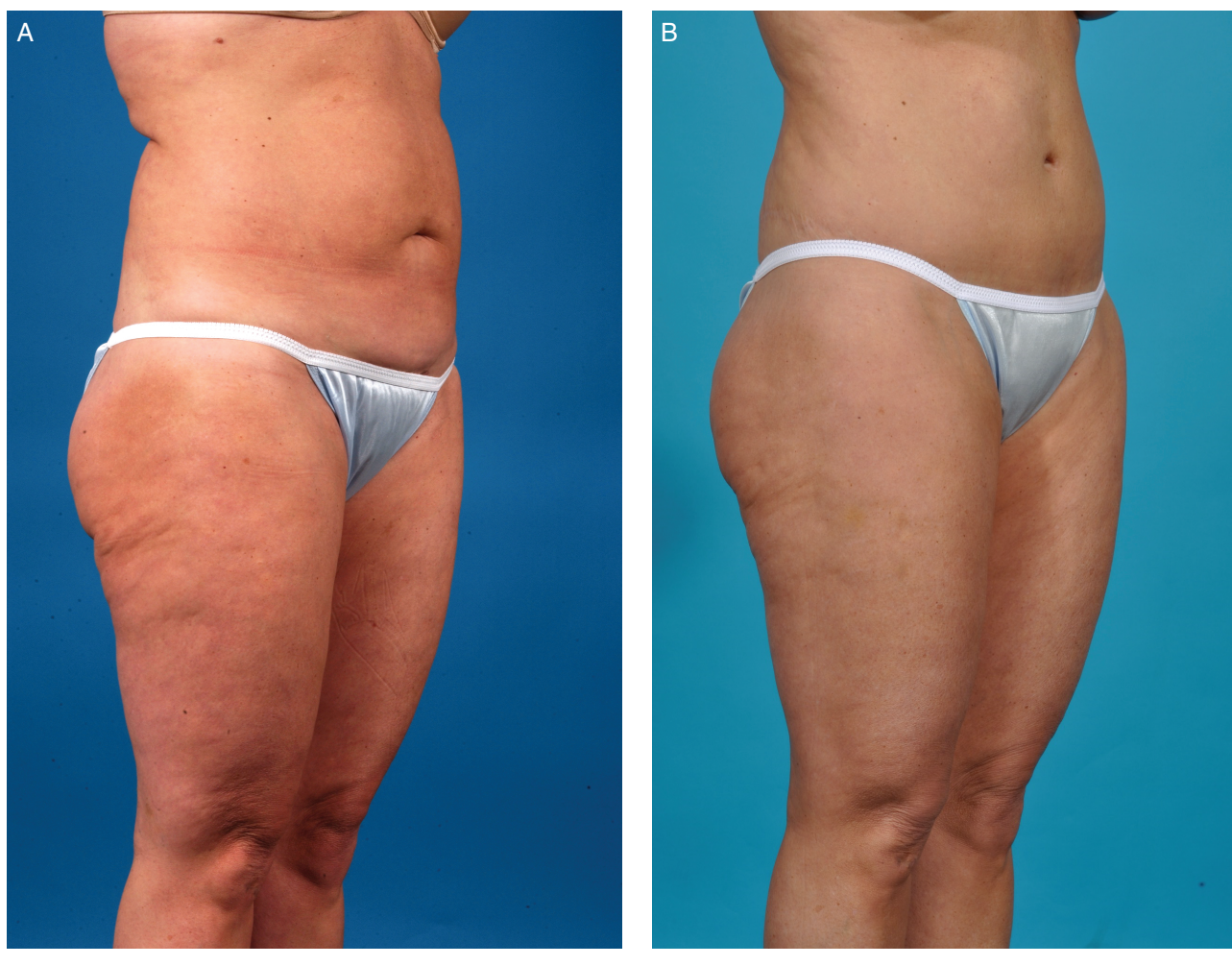
Figure 5. (A) This is a 47-year-old woman with abdominal skin laxity. (B) Six months after bipolar radiofrequency and radiofrequency microneedling treatment of anterior abdomen. Note preoperative supraumbilical skin laxity that is improved with radiofrequency treatment and not suction assisted liposuction alone.