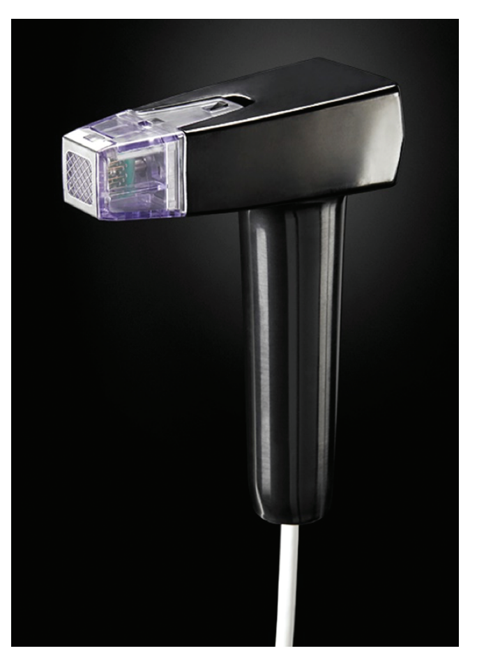
Figure 2. Radiofrequency microneedling device (Morpheus8, InMode Aesthetic Solutions, Lake Forest, CA).

RF microneedling systems advance existing technology by adding heat at controlled depths (Figure 2). Similar to fractional laser, fractional RF microneedling treats segments of the skin and soft tissue, leaving islands of untreated areas to reduce recovery time. Studies have shown active dermal remodeling by 10 weeks post-procedure with increased