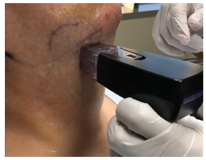
Video 1. Demonstration of radiofrequency microneedling technique.