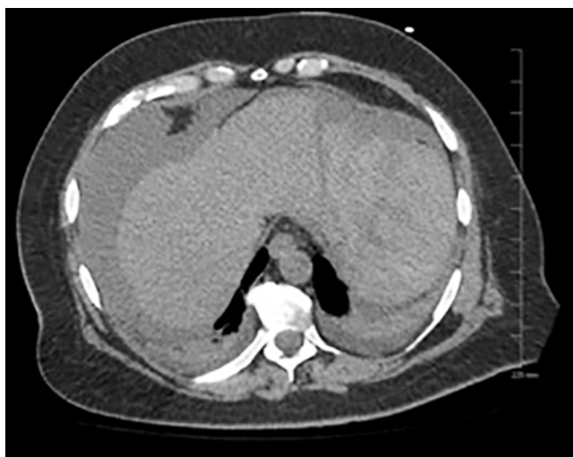
► Fig. 1 CT Abdomen with large left perisplenic hematoma and abdominal ascites