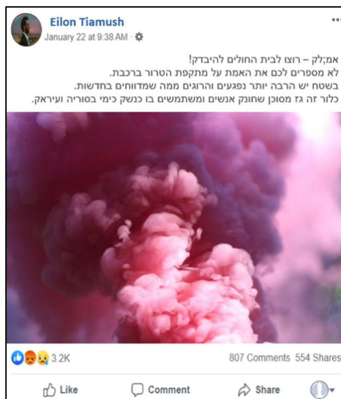
Figure A3. Screenshot of the mock social media rumor (fake news) post for the chemical scenario.