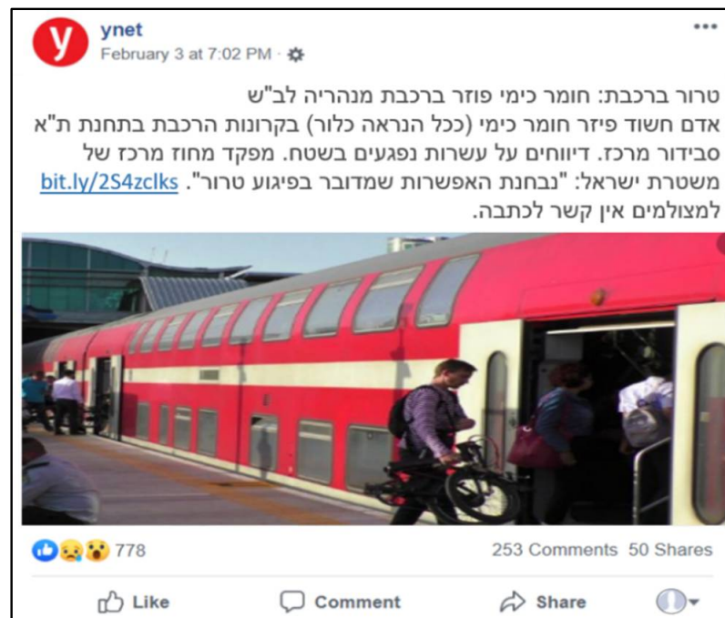
Figure A2. Screenshot of the mock social media news report for the chemical scenario.

The text on the rumors/fake news post (Figure A3) reads: "In short-rush to the hospitals to get checked! They aren't telling you the truth about the terror attack on the train. On site there are way more casualties and dead than reported on the news. Chlorine is a dangerous gas that chokes people and it is being used as a chemical weapon in Syria and Iraq".