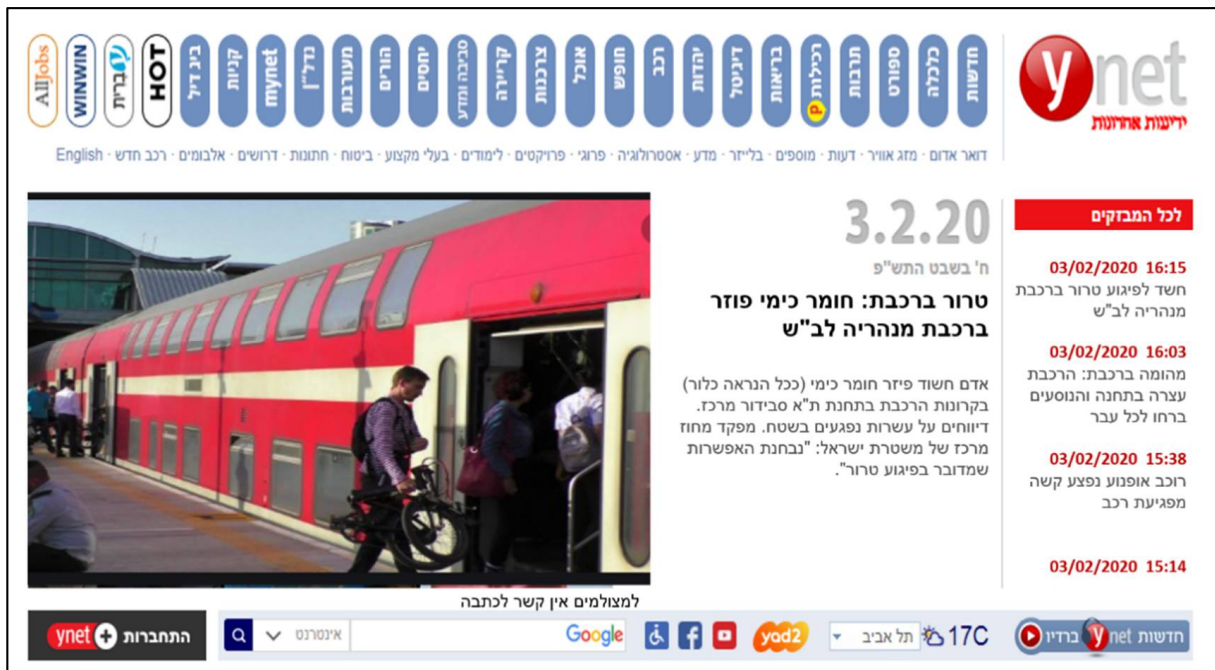
Figure A1. Screenshot of the mock classical news report for the chemical scenario.