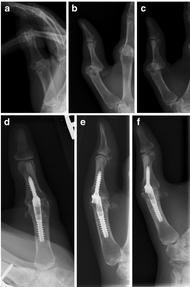
Fig. 2 a Preoperative AP radiograph, right thumb of 40 yo female with rheumatoid arthritis and metacarpophalangeal joint instability and arthritis (Pt. 9). b Preoperative lateral radiograph, right thumb of Pt. 9. c Preoperative oblique radiograph, right thumb of Pt. 9. d Postoperative (5 weeks) AP radiograph, right thumb of Pt. 9 showing intramedullary compression device and fusion of metacarpophalangeal joint. e Postoperative (5 weeks) lateral radiograph, right thumb of Pt. 9 showing intramedullary compression device and fusion of metacarpophalangeal joint. f Postoperative (5 weeks) oblique radiograph, right thumb of Pt. 9 showing intramedullary compression device and fusion of metacarpophalangeal joint

MCP instability (five patients), TMC and MCP osteoarthritis (one patient), MCP instability alone (two patients), rheumatoid arthritis (three patients), chronic post-traumatic MCP arthritis and instability (one patient), and chronic post-traumatic MCP instability (one patient). Only one patient had isolated thumb MCP arthrodesis. The most common concomitant procedure was TMC arthroplasty (12 patients), which included trapeziectomy and soft tissue reconstruction. One patient underwent revision TMC arthroplasty as a concurrent procedure. One patient with rheumatoid arthritis underwent silicone implant arthroplasty of the 2 nd –5 th MCP joints, one patient had tendon transfers for radial nerve palsy, one rheumatoid patient underwent removal of a wrist implant and wrist arthrodesis, and one patient underwent total wrist