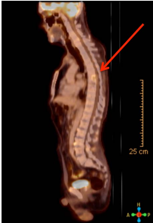
Figure 2 Sagittal PET-CT image of a spine metastasis. Location of spinal metastasis (red arrow) in a CT-merged 18F-fluorodesoxyglucose positron emission tomography (PET).

considerably improved with reduced nausea and back pain and improved appetite and weight gain. After a new rise in calcium levels, another 60 mg of denosumab were injected, yet again followed by reduced and stable serum calcium levels over months despite high PTH levels. In total, six doses of denosumab during the following months led to stable calcium levels without further need for inpatient treatment. By November 2014, PTH levels peaked at 413 pg/ml; however, another denosumab injection sufficiently stabilized serum calcium. Clinically relevant side effects were not observed. Resection of a new supraclavicular metastasis on the left side in August 2014 did not affect PTH levels significantly. In February 2015, another three cervical metastases were removed. Again, after repeated Denosumab injections, calcium levels remained above normal but stable until the last follow-up in May 2015. The follow-up period included 25 months in total after the first denosumab injection.