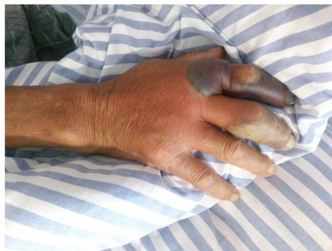
Fig 3. V. vulnificus infection that presented as swelling, Hemorrhagic bulla and phlegmon are observed on the right hand.