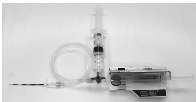
Figure 1 The digital pressure monitor system used to measure intra-capsular pressure of cadaveric hip. The whole system consists of a 18-gauge 3.25-inch epidural needle (Perican® with Tuohy bevel, B. Braun Melsungen AG, Brazil), an unyielded 54-inch connection tubing designed for arterial line measurement, a 3-way stopcock, a 25 ml syringe, and the Quick Pressure Monitor Set mounted inside the Stryker Pressure Monitor (Stryker Inc, Cedex, France). The Quick Pressure Monitor Set consists of a membrane drum, and a 3 ml syringe. It is manufactured by the same company as the consumable for the pressure monitor. The system was primed with saline.

years (mean = 84.2, standard deviation = 6.7). Twenty-two cadavers (69.8%) were female. Their body height varied from 124 to 168 cm (mean = 144.8, standard deviation = 7.3) whereas body weight varied from 41 to 62 kg (mean = 54.8, standard deviation = 4.5). The body mass index ranged from 16.1 to 25.2 kgm -2 (mean = 21.1, standard deviation = 2.0).