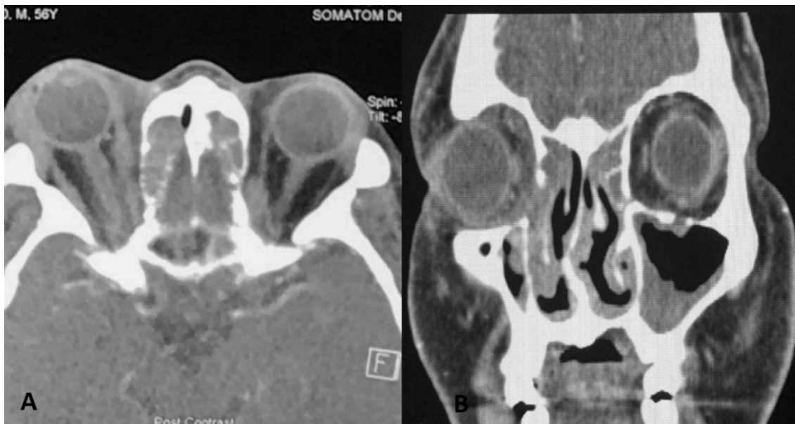
Figure 2: CT scan imaging of the orbit and paranasal sinuses: A) Axial view (left) demonstrated right periorbital soft tissue swelling with right extraocular muscle bulkier compared to left side. There was enlargement of the right lacrimal gland. Soft tissue density was seen within ethmoidal air cells. B) Coronal view (right) demonstrated soft tissue density in the frontal sinus, ethmoidal air cells and mucosal thickening in both the maxillary sinuses with obliteration of both osteomeatal complex. There was erosion of the right lamina papyracea.