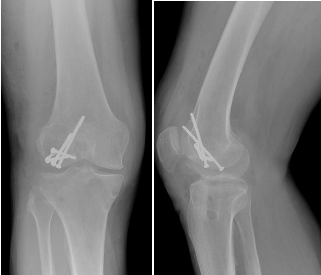
Figure 2 Post-operation Radiograph.

a complicated operation by nature, since the location of the primary graft tunnel and previous fixation hardware limits the choice of new tunnel placement and fixation options (7). It has been reported that improper femoral or tibial tunnel placement is responsible for up to 60% of graft failures in primary ACL reconstruction (2,7). Femoral condyle fracture is an extremely rare complication of ACL reconstruction surgery. All previous reports have presented femoral fractures occurring after ACL reconstruction and none have been during the revision procedure (1,3-5,7). Decreased bone mineral density up to 20% has been observed following knee ligament injury that might additionally contribute to the fracture of femoral condyle during or after ACL reconstruction because of decreased bending stress on the distal femur (1,4). This condition might be persistent even up to 2 years after ACL reconstruction despite aggressive rehabilitation, and there is predilection of bone loss especially at the lateral femoral condyle and medial tibial plateau (1). Given these facts, chemotherapy with bisphosphonates might be effective in patients with ACL injury by reducing bone resorption.